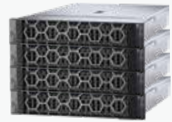
SyntEmergency Enterprise (S500 Series)

SyntEmergency delivers robust data protection with a suite of powerful features designed for ease of use and comprehensive coverage: